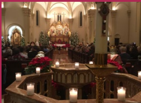
A photo taken from the main doors of the Cathedral.