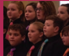
Kentucky Youth Choir Page 7