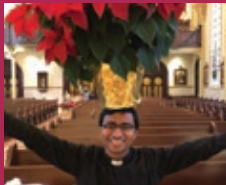
Christmas at the Cathedral Page 4

A quarterly publication of the Saint Stephen Cathedral parish