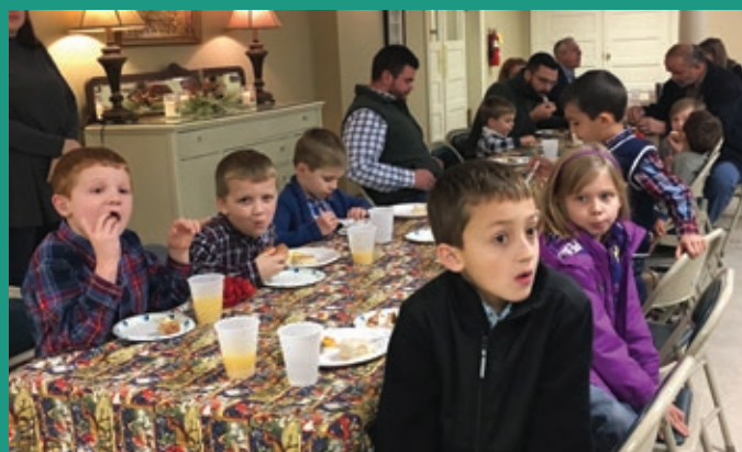
The meal and gathering was enjoyed by some of our young parish family members (and those who are young at heart!)