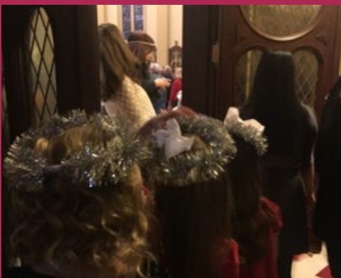
A few of our little parish "angels" (and a shepherd in the background) waiting to return to Mass after Children's Liturgy of the Word.