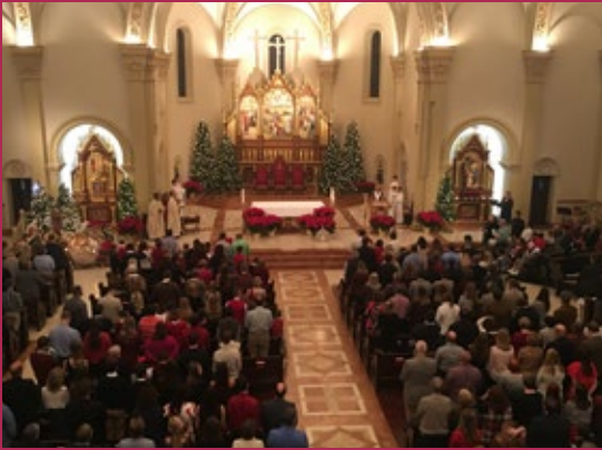
A wonderful Christmas Eve Mass, complete with joyful worshippers, lovely decorations, and beautiful music!