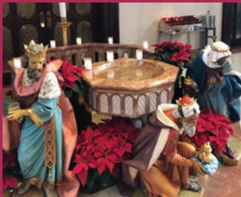
Melchior, Casper, and Balthasar (Magi) gather at our Baptismal font for a long journey!