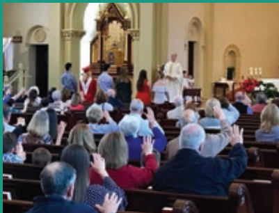
Honoring High School Seniors at 11am Mass