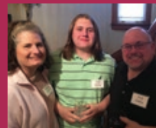
Welcome New Parishioners Page 6