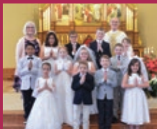
First Communion Page 3