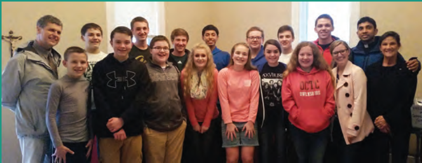
With the Youth Group before Youth 2000