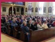
2015 Men's Conference Page 3

A quarterly publication of the St. Stephen Cathedral parish