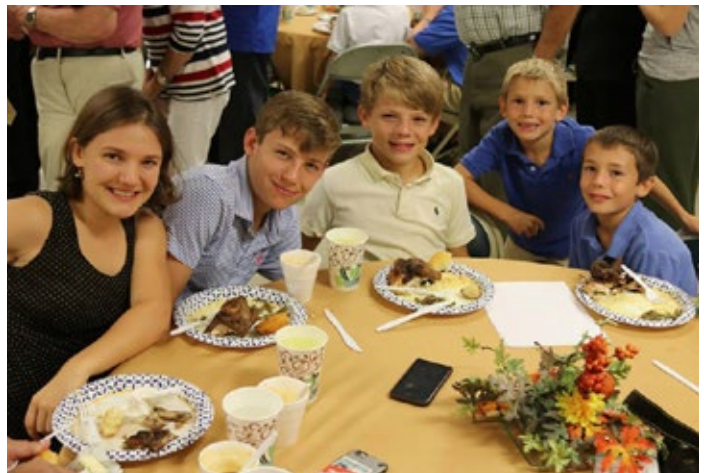
The Kurtz siblings enjoy their time together.